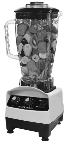
MMT Series Variable Speed Blender On/Off & Variable Speed & Timer Toggle Control