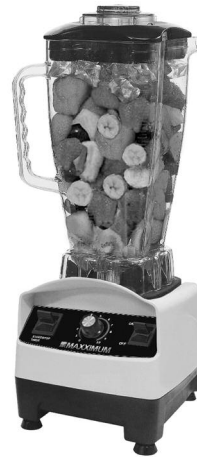
MMP Series Variable Speed Blender On/Off & Variable Speed Toggle Control