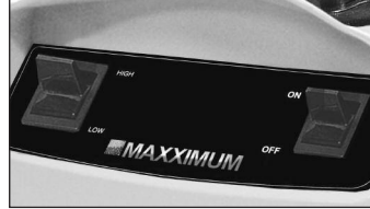
MMH Series Two Speed Blender On/Off & High/Low Speed Toggle Control