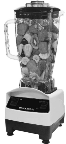
MMH Series Two Speed Blender On/Off & High/Low Toggle Control