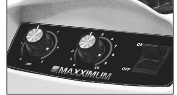
MMT Series Variable Speed Blender On/Off & Variable Speed & Timer Toggle Control