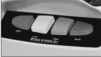
MMV Series Value Blender On/Off & High/Low & Pulse Push Button Controls